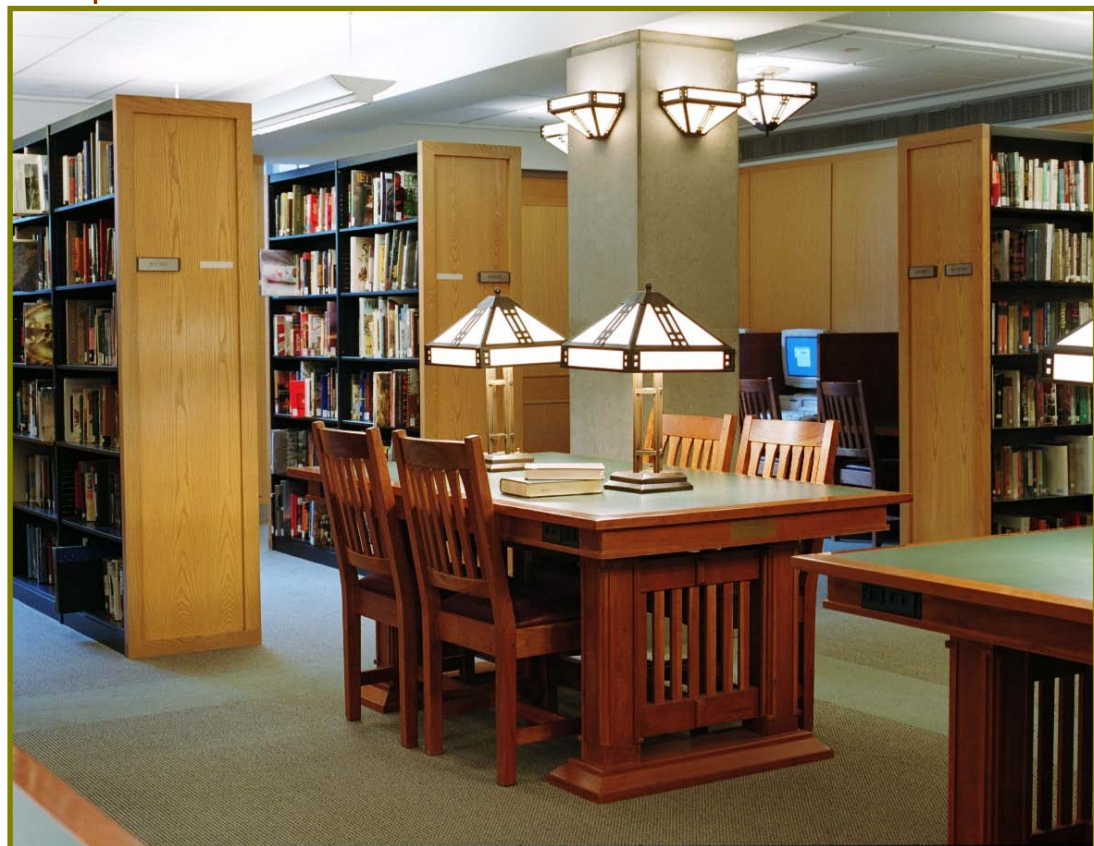
Project: Agnes Irwin School, Rosemont, PA