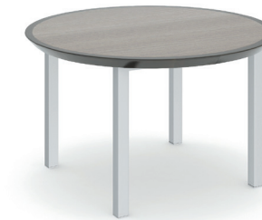
Fluid Round Table in Diameter 36", 42", 48", 54", 60"