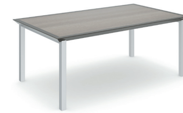
Fluid Rectangle Table in width x depth 30" Depth: 36", 42", 48", 54", 60" 72" 36" Depth: 42", 48", 54", 60" 72"

The Fluid Table series is available in the following shapes and sizes: