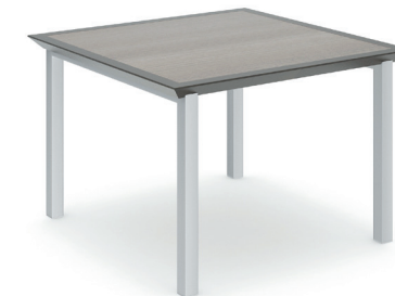
Fluid Square Table in width x depth 36", 42", 48"