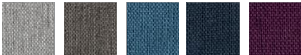
Wind Chime 905 Mud 908 Air 3003 Denim 3006 Zantium 3009