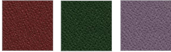
Burgundy 108 Green 208 Purple 1009