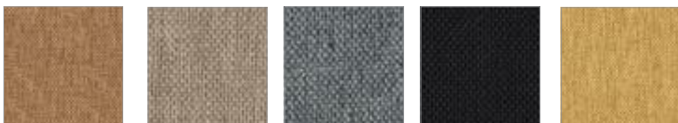
Saddlewood 8006 Buff 6009 Steel 9003 Licorice 9009 Old Gold 4009