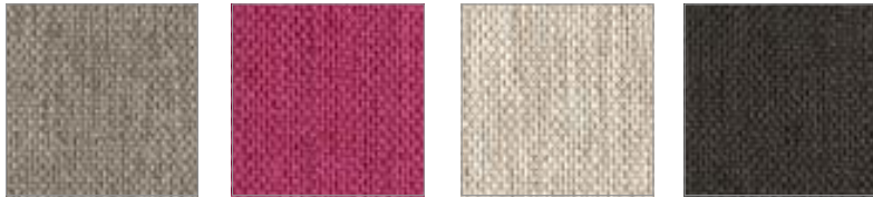
Fawn 67 Radiant Orchid 102 Linen 608 Beaver 808