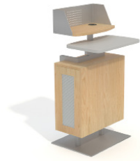
TM-5 Usage Option